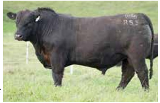
Left: MM Rector at 18mths

Australian sires Millah Murrah Rembrandt and Millah Murrah Rector have a small representation of sons with some crackers amongst them. There will be more to come next year.