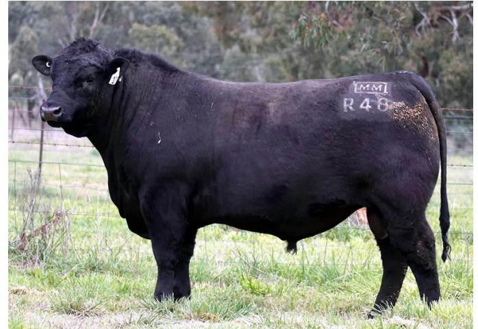
Below: MM Rembrandt at 18mths